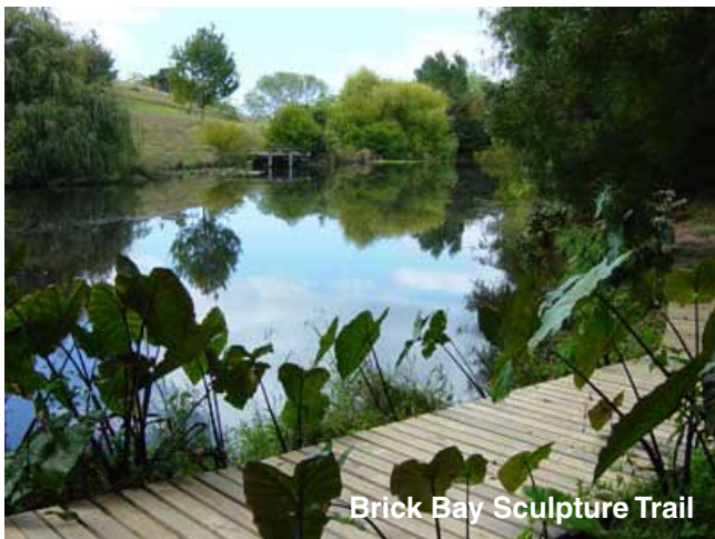
Brick Bay Sculpture Trail

Arrive at Warkworth Lodge, check in to your stylish suite and rest while taking in the atmosphere of this charming boutique motel. Self-cater your evening meal or enjoy one of the restaurants and bars a short stroll away – including “Tahi Bar” where you can sample many of New Zealand’s finest micro brewery beers - real beer made by people passionate about their craft.