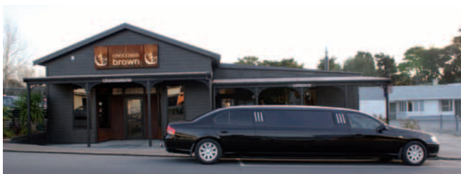
Our 9-seater Stretch Limousine outside Chocolate Brown

Dinner Limousine Transfer: Sit back and let us do the driving. Our nine passenger black Stretch Limousine will deliver you to dinner in style. Includes a one hour cruise on the way to a restaurant of your choice, a complementary bottle of grape juice and return trip to the Lodge.